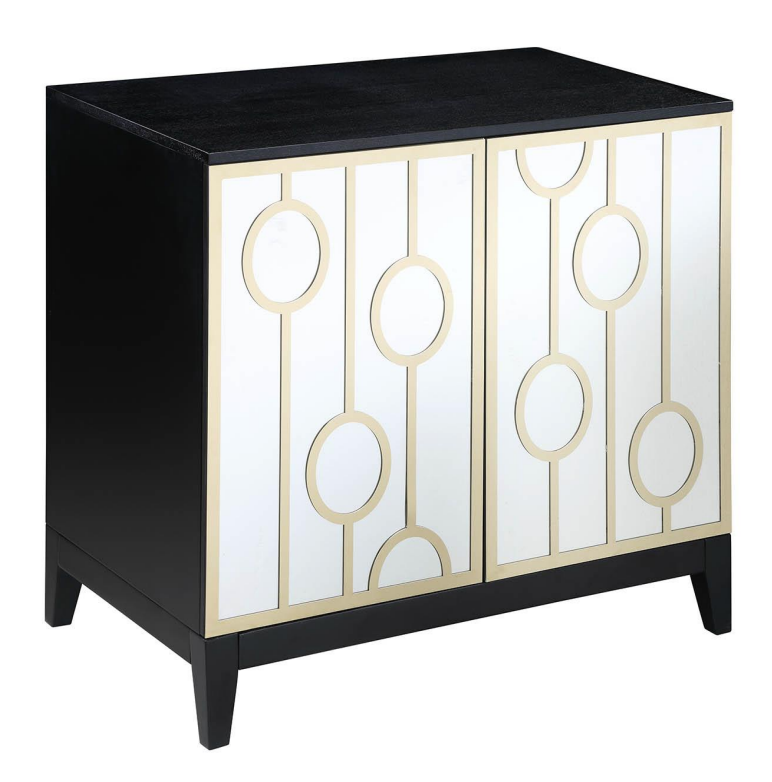
Fine Furniture for every stage of life